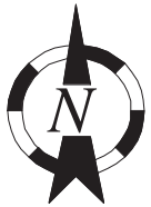
central campus map scale